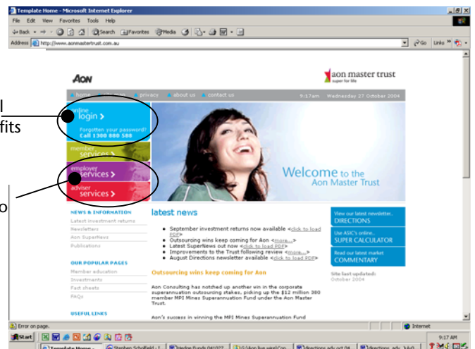
Aon Master Trust home page

Enter your user name (adviser) and password (AMT588) to go to the dedicated adviser page